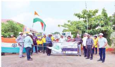
Deputy Transport Commissioner Karim flags off the road safety rally at Kaza toll plaza in Guntur district on Thursday.

"EVERYONE must follow traffic rules and motorists should realise that if they take responsibility, safety will arrive," said Deputy Transport Commissioner SK Karim while flagging off the road safety awareness rally jointly organised by SRM Foundation and Gems School near Kaza Toll Plaza