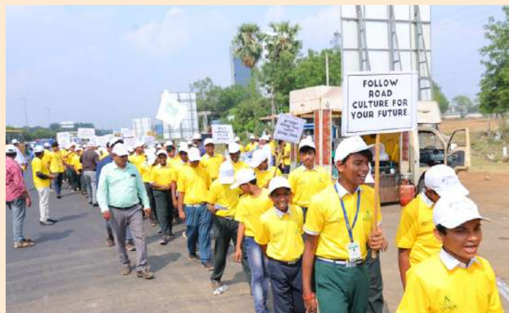
Students Road Safety Rally by Gems School, Guntur

SRM Foundation, Chennai, SRM University AP & Gems School, Guntur jointly organized a Workshop on Road Safety & National Productivity (Quiz, Skit & Students Rally) on April 27, 2023 at Gems School, Kaza Village, Guntur.